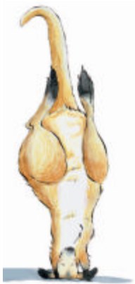
1) ndsat no uoyr dhae