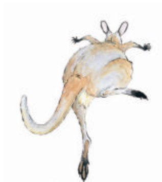
2) ohp no uoyr fetl egl